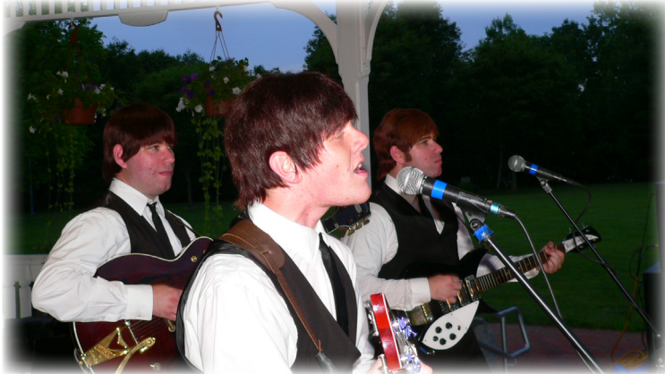
Early Beatles tribute band Studio Two recently signed to appear at Bellingham Town Common on Wednesday night July 27.